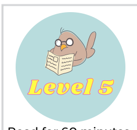
Read for 60 minutes