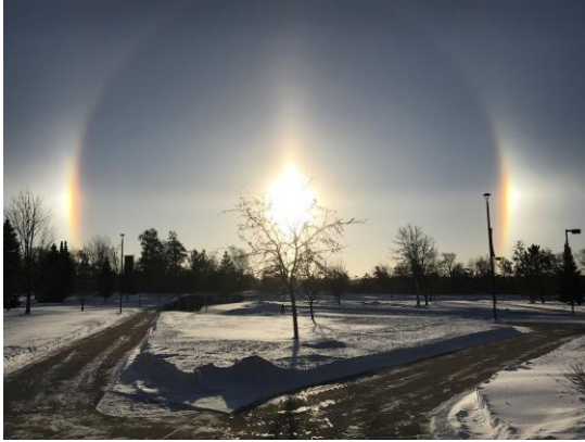
Parhelion or "sun dog"

The image below is called a parhelion or "sun dog", which is a bright spot in the sky that appears on either side of the sun. The spots are formed by the sun passing through ice crystals in clouds. You can sometimes see all of the colors of a rainbow in a parhelion.