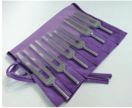
Set of tuning forks