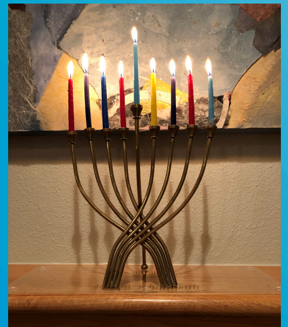
Our Chanukah Menorah on the eighth night.

In my family we celebrate all the Jewish holidays such as Chanukah, which commemorates the Jewish victory in Jerusalem over the Syrian Army over 2,000 years ago, and Passover, which celebrates the Jews' exodus from Egypt where they had been slaves.