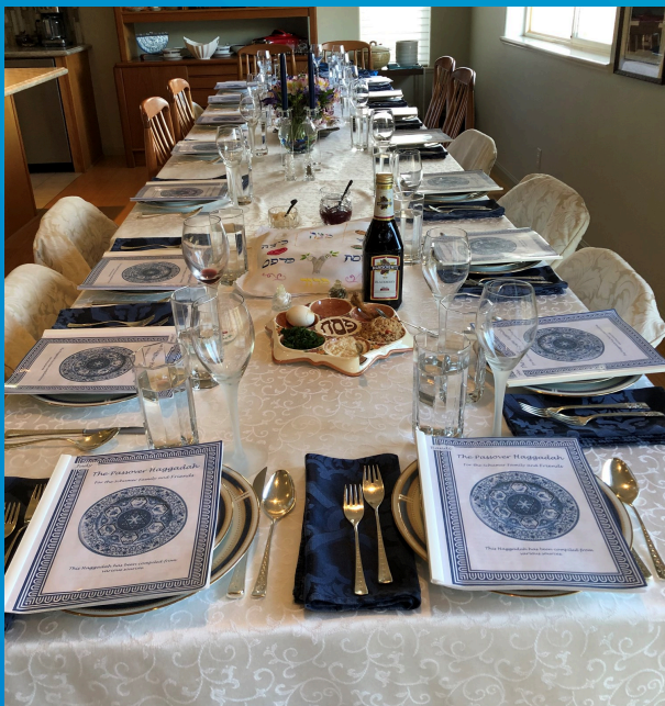
The Passover table just before the Seder - the Passover meal - and the story of the Exodus from Egypt is read from a booklet called the Hagaddah .

I attended public schools but I also went to Jewish after-school and Sunday programs that taught Jewish history, culture, and religion. In these classes — and from my parents — I learned to be very proud of my heritage. I also learned that, though Jews are a small part of the population, they have made enormous contributions to world society in science, literature, the arts, politics, and many other fields.