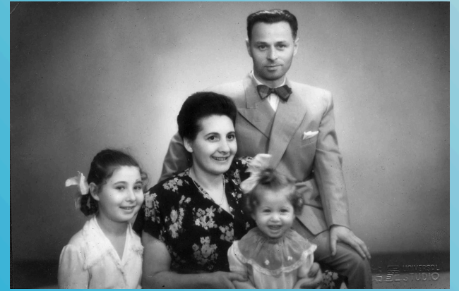
My family in Shanghai in 1947.