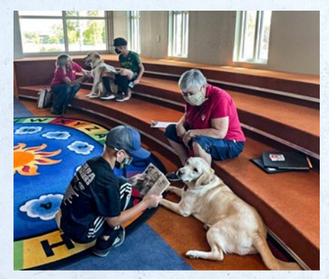
Visit the Paws 2 Read dogs at the Spanish Springs branch on the second Sunday of every month!